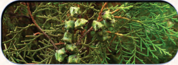
Bai Zi Ren - Biota